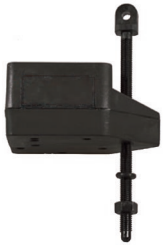
HRU epirb model HRU002-E