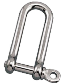
HRU shackle HRUHK-SH