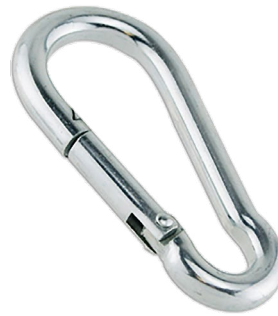
HRU carabineer HRUHK-CA

T-ISS can supply you with various hooks which are suitable for our HRU-models and are made out of seawater resistant SS316 Stainless Steel. They have a breaking strength that complies with the ISO regulations ISO6892. All hooks are packed in sets of 10 pieces.