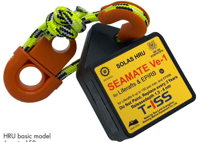
HRU basic model 6 up to 150 pax HRU001-L

The pressure of the water on the casing causes a knife to cut through a rope and thereby releasing the life raft. This same principle applies on the HRU for EPIRB's, whereby the bracket which holds the EPIRB is released. The EPIRB model is delivered with the bolt and nut to connect the EPIRB to your vessel.