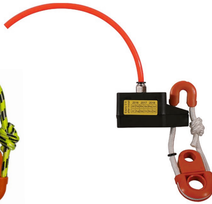
HRU remote released model HRU004-R