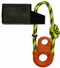
HRU mini model 1 up to 12 pax HRU003-M