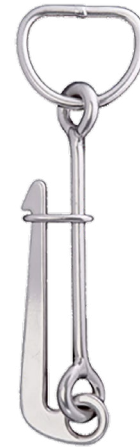
HRU sliphook HRUHK-SL